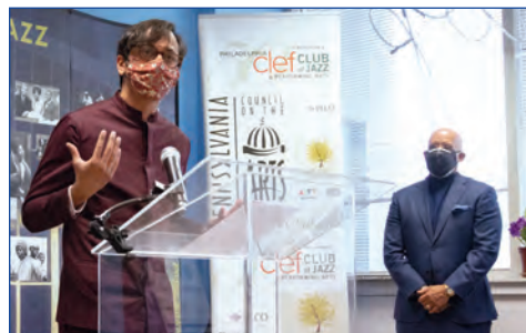
▲ With Senator Vincent Hughes, presenting a $600,000 grant to the Philadelphia Clef Club of Jazz and Performing Arts. This funding will help ensure its continued success and prosperity as a jewel of local music performance and education.