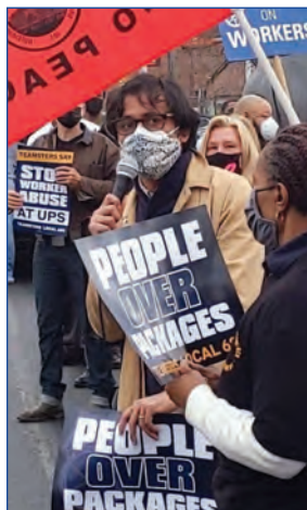
◀ With Teamsters Local 623 at a rally after one of their members was injured on the job. The health and lives of our essential workers are more important than the work they are doing, and an injury to one of us is an injury to all of us.