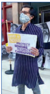
➤ With SEIU HCPA to call for updates to state nursing home regulations so that caregivers are supported in providing the highest quality care to those they care for.