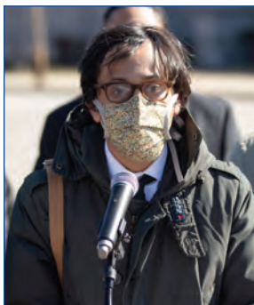
◀ With colleagues in the Senate and the House, and advocates and organizers, calling for the expanded use of reprieve to keep incarcerated people who are elderly and medically vulnerable safe amidst skyrocketing COVID cases in state prisons.