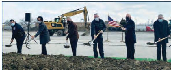
▲ At the groundbreaking ceremony for the PhilaPort Distribution Center. PhilaPort is the fastest-growing container port in the United States, bringing good, union, family-sustaining jobs to our district and our city.