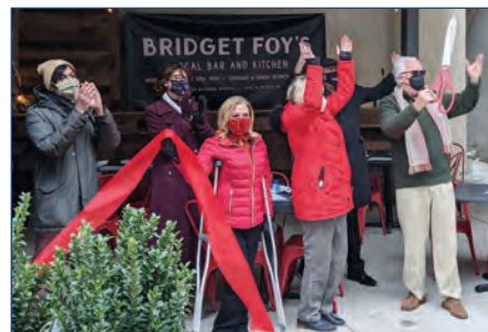
▲ At the ribbon-cutting ceremony for the opening of the new Bridget Foy's, an institution on South Street.