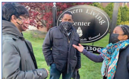
▲ At the Northern Living Center with Senator Sharif Street to fight food insecurity through the program Driving Away Hunger During Ramadan.