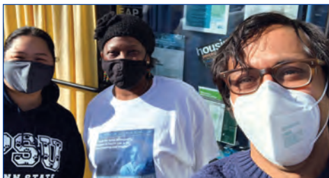
▲ With the Brewerytown-Sharswood Neighborhood Advisory Committee, honoring Martin Luther King, Jr. through community work with Philabundance.