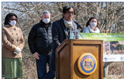
▲ At FDR park to announce a $4.5 million grant for the transformation of its historic stable and guardhouse into a Welcome Center with resources for visitors and space for educational programming and events.