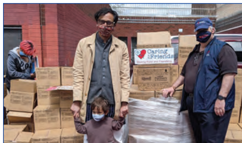
▲ At the Taggart Elementary Book Drive to distribute backpacks, food boxes, hygiene supplies, and information to South Philly Families.