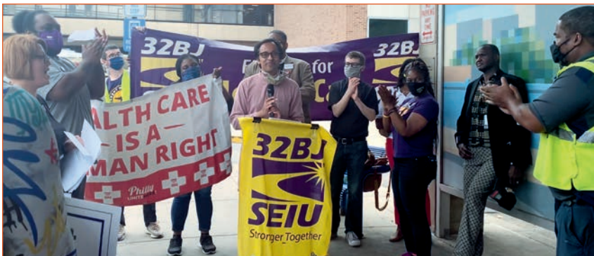
◀ Standing with UNITE HERE Philly and SEIU 32BJ to demand living wages for the essential workers at the Philadelphia Airport! Under the hardest conditions, they've made sure we have food, supplies, and medicine to make it through.