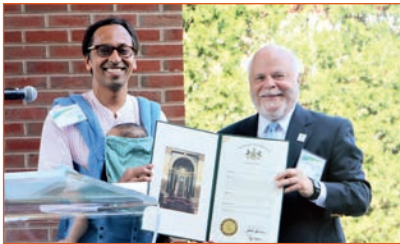
▲ Presenting a Senate citation to Gift of Life Family House for its 10th anniversary! The Gift of Life Family House is a home away from home for transplant patients and their families, providing a safe and comfortable place to stay, ongoing care and support, and even home-cooked meals.