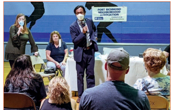
▲ At the Port Richmond Neighborhood Association's monthly meeting. It was fantastic to meet neighbors and talk about the ways that my office can be of service.