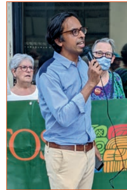
◀ With Juntos, MILPA, VietLead, Asian Americans United, New Sanctuary Movement of Philadelphia, and impacted loved ones at a rally to call for the release of all people detained by ICE at York County Prison. I'm fighting on behalf of every person who calls our city, and our state, home. And every person who wants to, but can't.