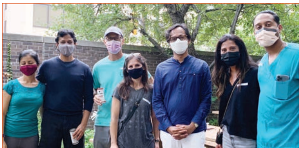
◀ Meeting parents from Greenfield Elementary on the first day of school! I appreciated the time spent talking with me about their hopes and concerns at the start of the school year.