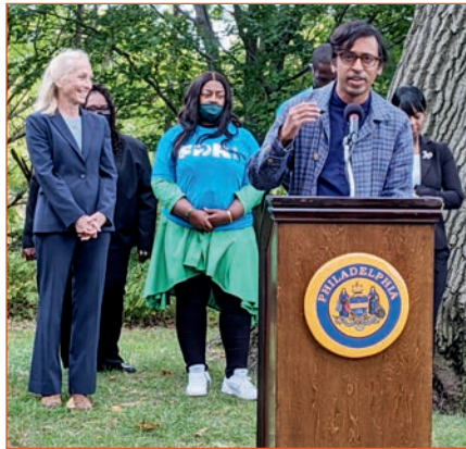
▲ Unveiling plans for the new Welcome Center and Play Space at FDR Park! The planning process was conducted in seven languages, and more than 3,000 people participated. This shows clearly Philadelphians' devotion to FDR and its continued success.